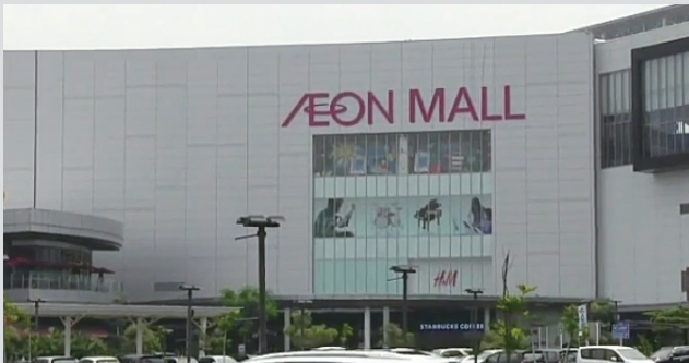
AEON mall, Indonesia